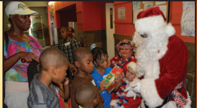
Santa Claus helped pass out over 400 new sneakers to needy children

Over 30 homeless individuals took the first step in building a brighter future by deciding to enter our life-changing program this past Fourth of July Weekend. A big Thank You goes out to all of the volunteers, donors and supporters that made the 2011 Christmas in July celebration possible!