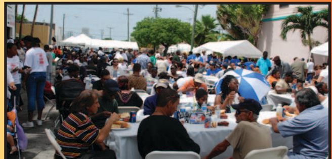
Over 1,200 homeless and hungry celebrated Christmas in July in Miami, Hollywood and Pompano Beach