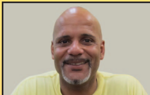
"I hit rock bottom when sleeping at a bus station one night..."