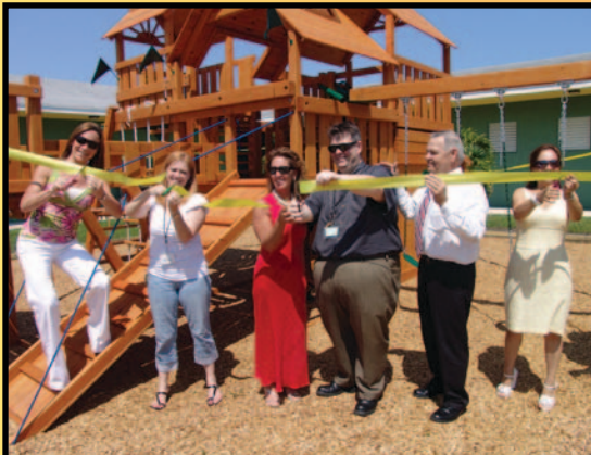
Ribbon Cutting For New Playground at Broward Outreach Center Pompano

For most children, Summer is remembered with waterparks, sunshine and vacations. However, there is an average of two homeless children in every classroom in America. For those, time outside of school is marked with uncertainty, doubt and confusion as to what the future may hold.