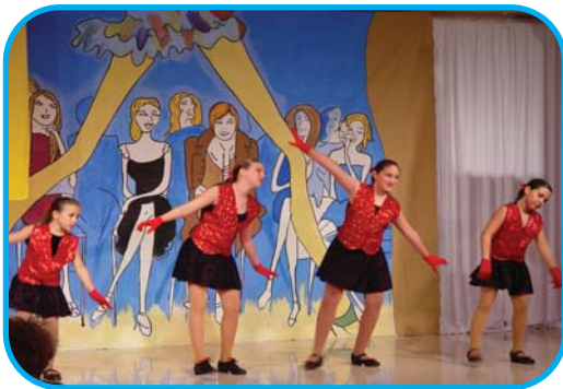
Left: The Arts Academy of Hollywood provided dazzling dancers and entertainment for the Fashion Show.